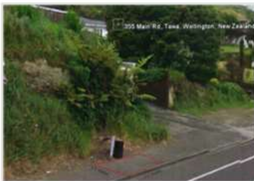
Regroup a cable terminal and push pairs