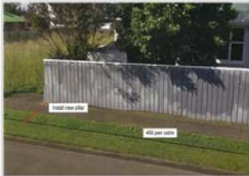
Cut in DP